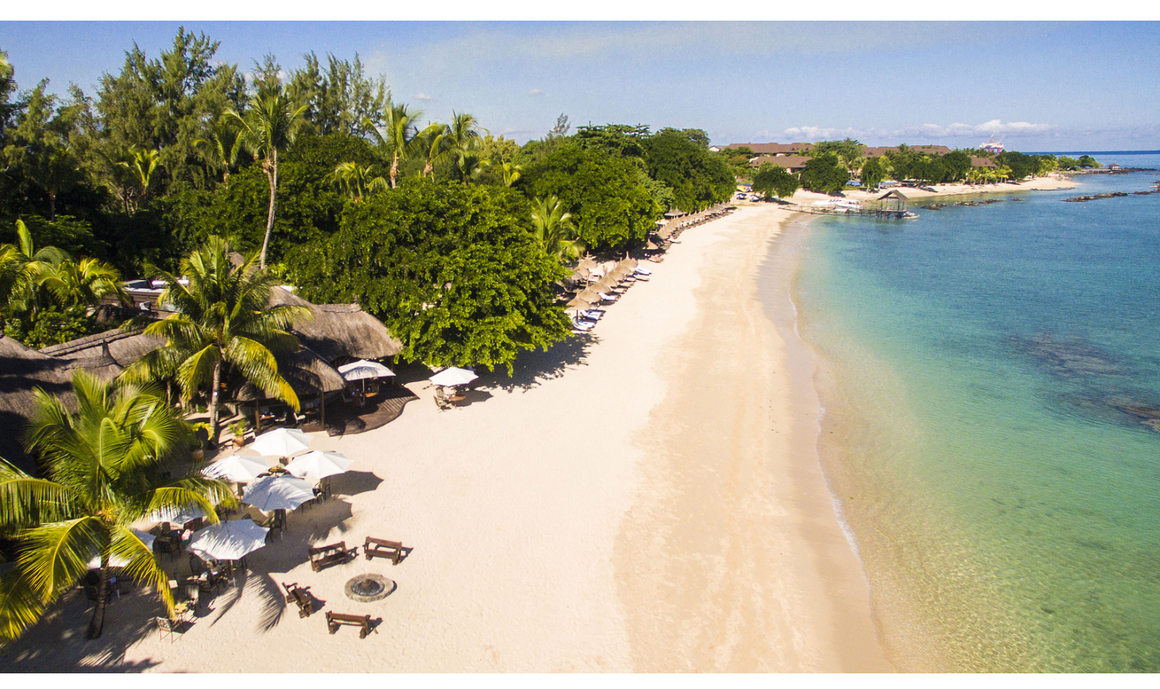
The Maritim Resort & Spa is set among tropical gardens on the edge of Turtle Bay, one of the most stunning bays on the sunny north-west of the island.